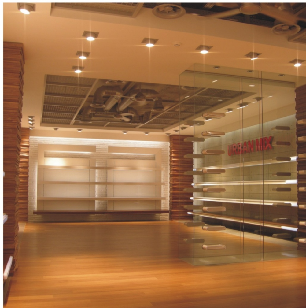
Runner-up for A' Design Award in Interior Space and Exhibition Design Category, 2013 - 2014.