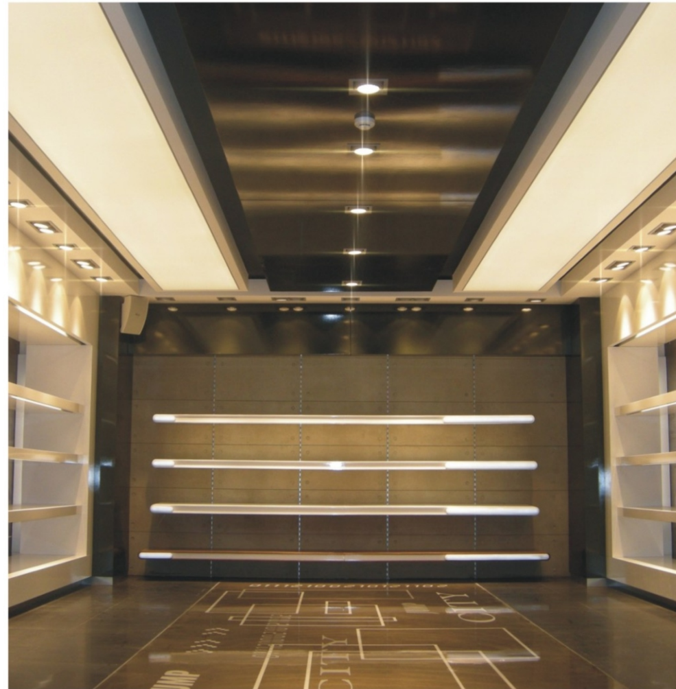
Runner-up for A' Design Award in Interior Space and Exhibition Design Category, 2013 - 2014.